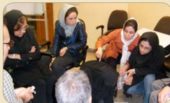
Workshops in Iran