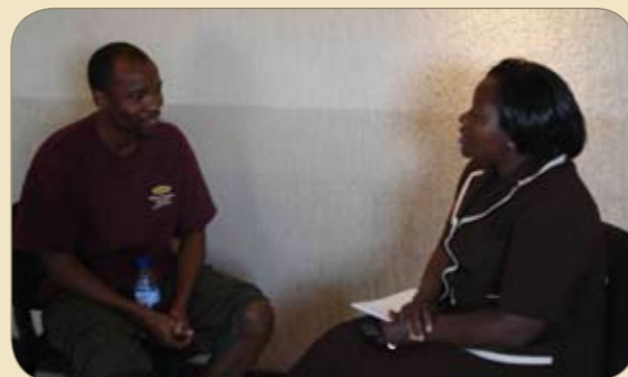
Practising interviewing skills: training for paralegals in Malawi

In March the 3 year programme to strengthen the capacity of NGOs to advocate women's rights ended with a detailed evaluation of its work. A variety of methodologies were used; community education meetings, developing radio broadcasts, publishing and distributing written information. An estimated 5,700 people attended community events with music, drama and talks to illustrate specific issues. Benefits included chiefs and community leaders who are much better informed. These Malawi programmes were funded by the Scottish Government.