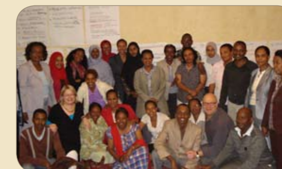
Members of Parliament trained as trainers in Ethiopia